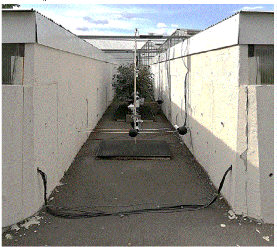
South view of the canyon street at 1/5th scale built at Institut Agro in Angers, France, on June 23, 2022.

Street trees can improve thermal comfort of city dwellers through the cast shadow and the transpiration they provide. These two mechanisms are linked to the crown light interception capacity which depends on tree architecture and leaf traits. These two characteristics can be themselves impacted by water availability. Yet, little is known on urban tree functioning regarding climate services they render in the context of global change and enhanced water scarcity.